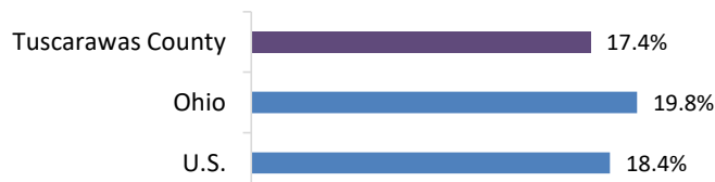
Percent of Children in Poverty 2017